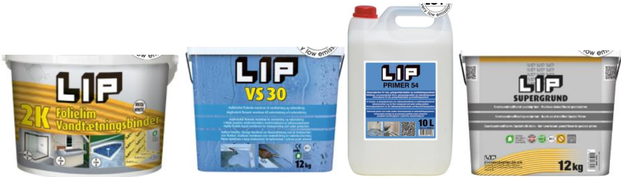
Figure 1: Pictures of the four LIP products covered in this project report.

LIP 2K Waterproofing adhesive, LIP vs 30 Waterproofing adhesive, LIP 54 Primer & LIP Supergrund.