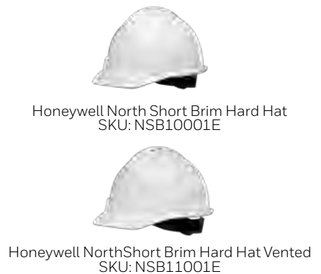
Honeywell North Short Brim Hard Hat SKU: NSB10001E

When creating the Honeywell North Short Brim Hard Hat, the two brands have combined their extensive market