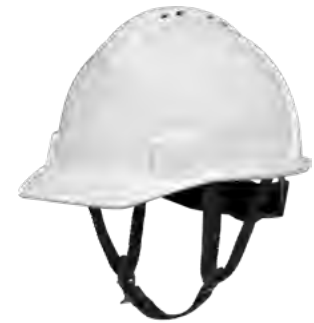
Chin Strap NSB100CS