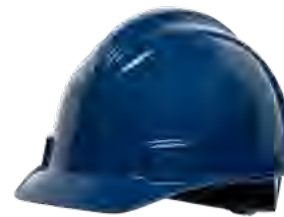
Dark Blue NSB10071E