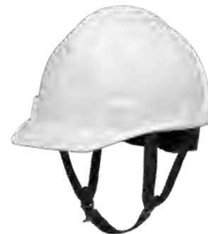
Chin Strap NSB100CS