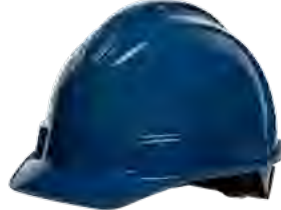
Dark Blue NSB11071E