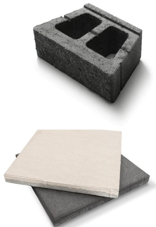
Figure 1. Illustrations of two product examples included in the product group assessed, both valid for the declared unit.